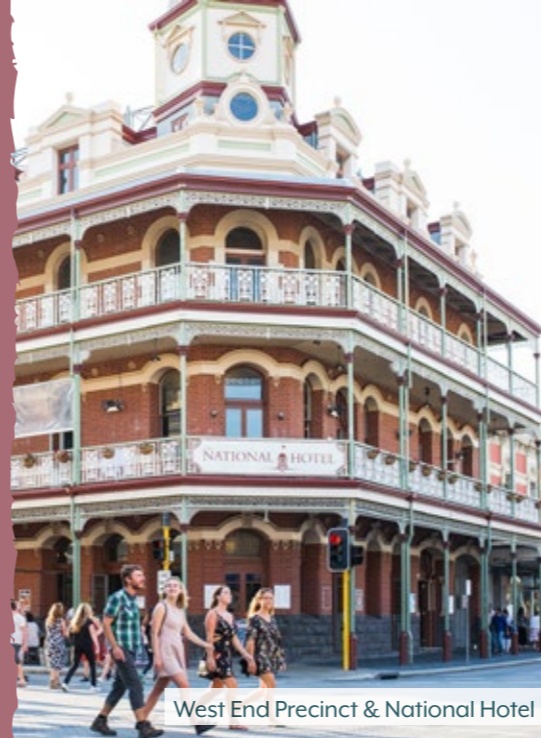
West End Precinct & National Hotel